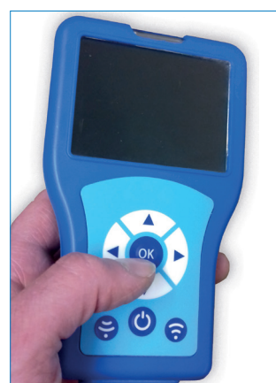
Hand Held Programmer