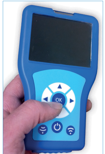
Hand Held Programmer

Standard pre-wired 15mm G202 solenoid valve for water pressure 0.75 bar - 10 bar. Optional low pressure valves also available on request.