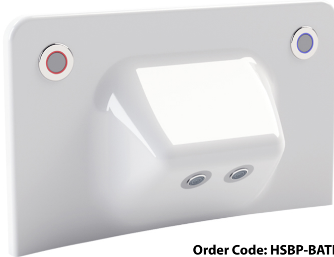
Order Code: HSBP-BATH

Backplate c/w 70mm Fixing Kit. Backplates include spout. Optional extension threads available for thicker walls. Backplates do not include sensors or touchpads. These need to be ordered separately.